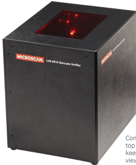
Comes with handheld top cover (not shown) to keep label in position on viewing window.